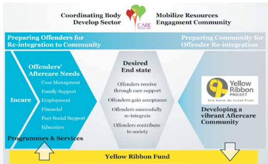
FIGURE 3: The Many Helping Hands Approach to Rehabilitation and Reintegration of Inmates and Ex-offenders

At the inaugural launch of the YRP in 2004, the SPS invited targeted groups such as volunteer groups, employers, policy makers and students to tour various prison institutions to deepen their understanding of life in prisons and their role in the rehabilitation journey (see Box 4). Talks held in schools and open house events heightened awareness of the needs of ex-offenders and their families and sparked new ideas of action that groups could take to support the reintegration process. The Singapore National Employers Federation and National Trades Unions Congress Income supported the skills competition and talent showcase launched in 2004. About 200 employers were invited to visit prison training facilities and witness the inmates' IT, multi-media and cooking skills, and encouraged to hire them. Subsequently, job fairs, employers' networking sessions and forums to discuss the reintegration of ex-offenders into the workplace were also organized. Corporate organizations were appointed as rehabilitation ambassadors and encouraged to contribute to YRP publicity efforts. Awards were given annually to recognize exemplary employers and corporate donors.